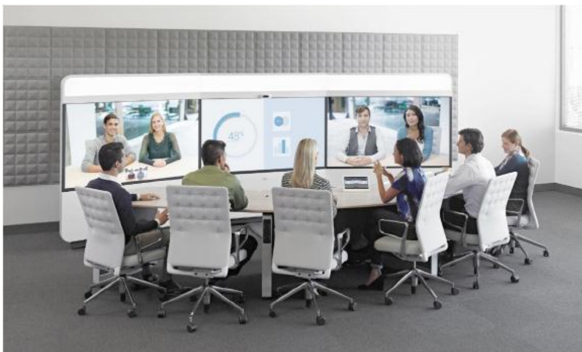
Figure 1. Cisco TelePresence IX5000, Six-Seat System

This sleek and powerful system incorporates an elegant triple 4K Ultra High Definition (UHD) camera cluster, three high-definition 70-inch LCD screens, and theater-quality audio to bring people together as if they were just across the table. The IX5000 Series includes the single-row, six-seat IX5000 system, and the dual-row, 18-seat IX5200 system.