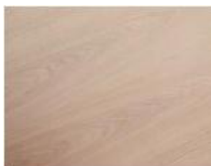
Figure 3. IX5000 Series Walnut Table Wood Option